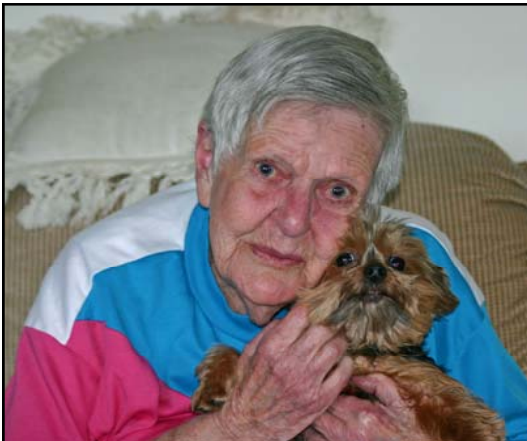
Sugar was rescued from a puppy mill where she was abused for 6 years. She now shares a loving home with Esther.